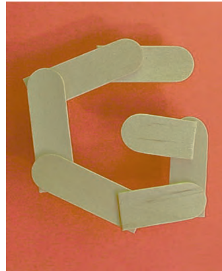
G- wood craft sticks, garden pruners to cut sticks, glue

How to: first dip the top 1/3 of the D in yellow. Then dip bottom 2/3+ of the D in red. Allow the red to overlap the yellow. dip bottom 1/3 in blue.