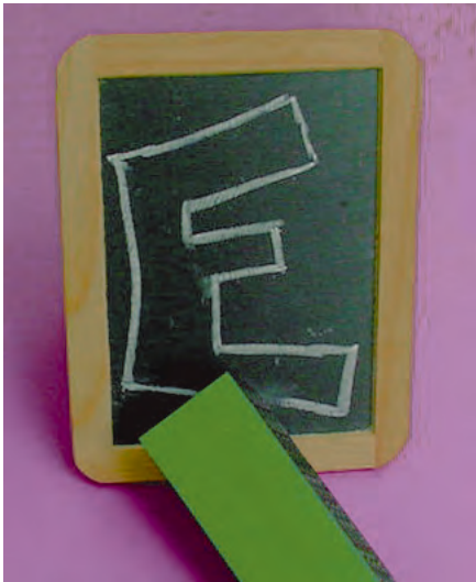
E- slate board or black poster board, chalk, eraser