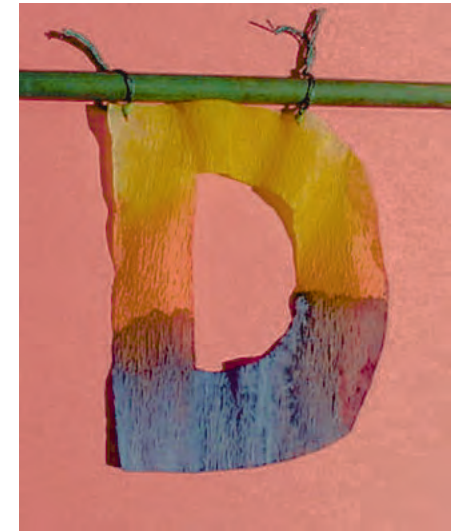
D- red, blue, and yellow food coloring, containers for food coloring (prepare according to directions for egg coloring but boost the amount of color), D cut from crepe paper or copy paper, scissors, needle, thread, and stick. (Last three items are optional)