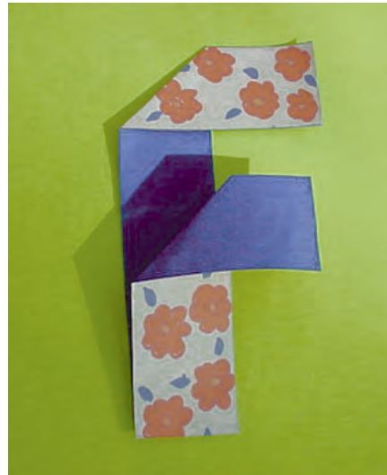
F- 2" x 17" strip of wrapping paper (solid color on one side), markers to decorate the other side