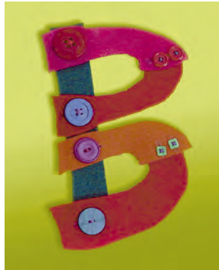
B- various colors of felt, buttons, needle and thread, scissors